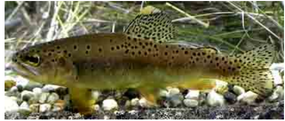
OPTU's Save the Natives – Apache Trout