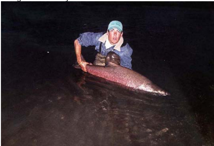
A nice King off the beach

Email Titus Piper ( fishedaz@earthlink.net ) with your name, address and zip code to receive a volunteer packet from Game and Fish. For members without email call 622-9597. After completing the packet, go to G&F to get fingerprinted, then send the packet to Phoenix. After a background check you will receive a calendar of events.