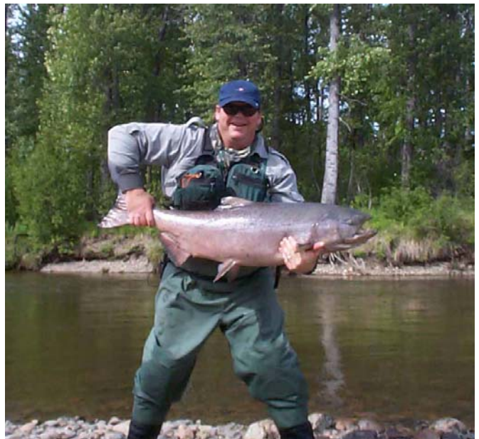
King on a fly