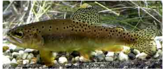
OPTU's Save the Natives – Apache Trout