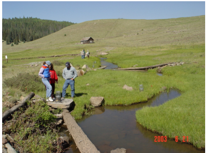
OPTU conservation efforts