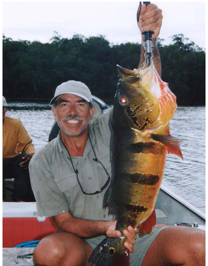
18 lb Venezuelan Peacock Bass