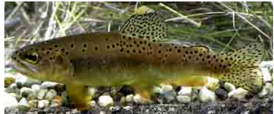
OPTU's Save the Natives – Apache Trout