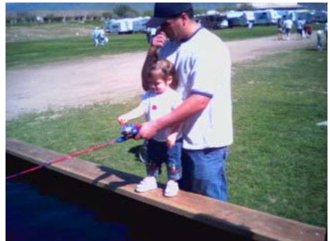
First timer now - cover of Fly Fisherman in 15 years