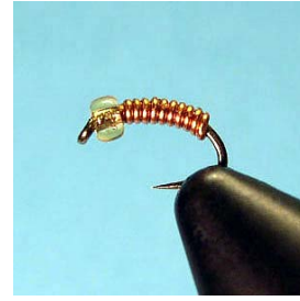
Bead head Brassie