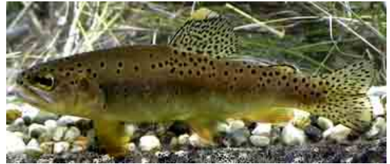
OPTU's Save the Natives – Apache Trout