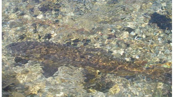
A nice New Zealand Brown

a meeting or event. This will give our region more dollars to invest in the preservation of our coldwater fisheries. Help stretch your dollars for the benefit of Arizona fisheries. Thanks.