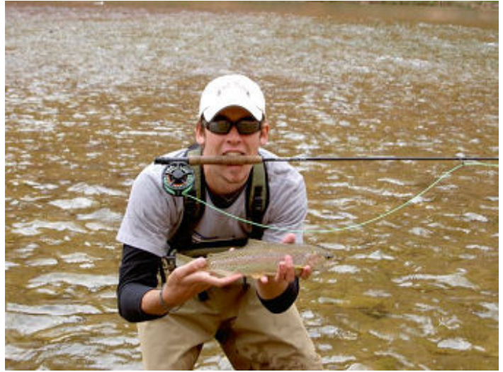
Those rods are tasty