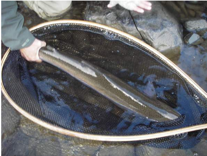
Nice Steelhead in the net