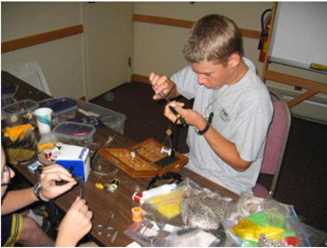
Tying flies at Trout Camp