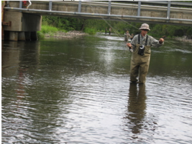
Applying some Trout Camp knowledge gained