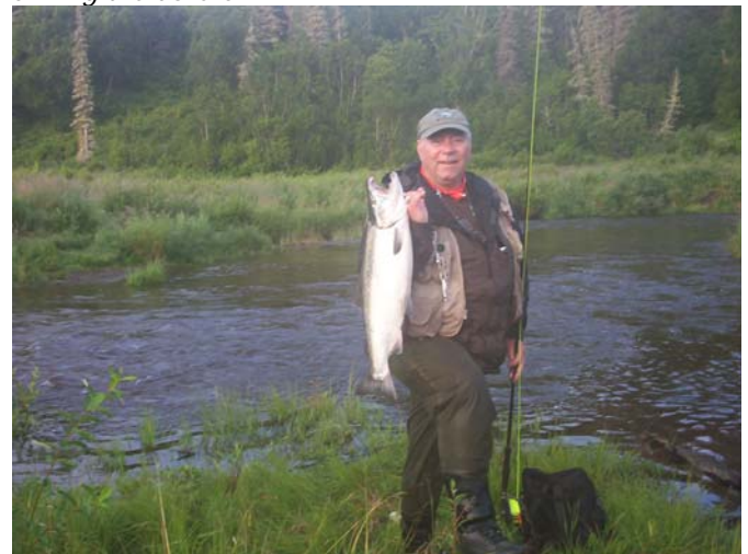
Nice Alaska Silver

NOTE from the editor – even good services go bad and some are never good – so it is worth trying to find people who have gone to a lodge or used a service recently before sinking the dollars.