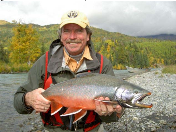
Male Dolly Varden in spawning colors – Upper Kenai, AK