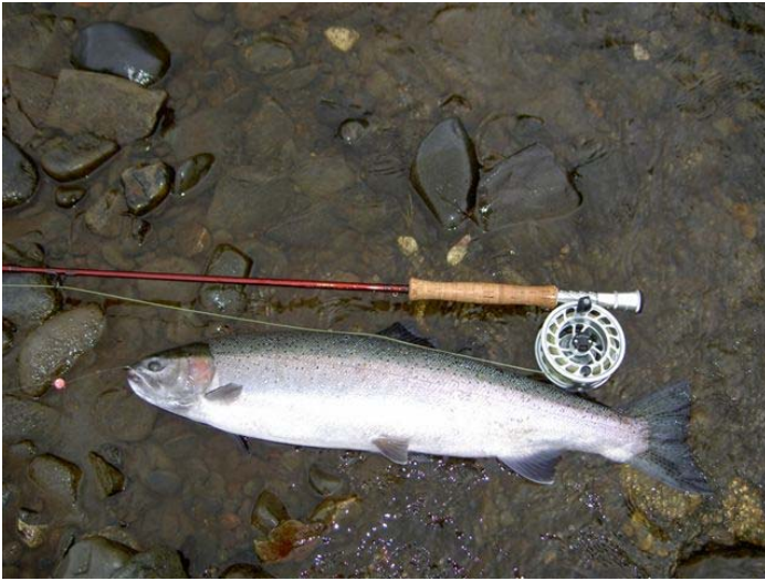
Deep Creek Steelhead

normally receive the printed version and the e-mail address where you want to receive the electronic version. Note – it will be your responsibility to inform us of changes in e-mail address. Otherwise, you may begin missing newsletters. The newsletter is available on our OPTU website www.optu.org .