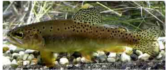
OPTU's Save the Natives – Apache Trout

Sheraton Tucson at 5151 E. Grant Rd (NE corner of Grant and Rosemont) – 7 pm.