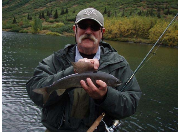
A nice Alaska Grayling

Because my wedding will be sooner than you think.