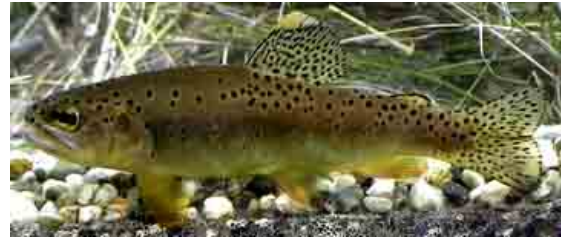
OPTU's Save the Natives – Apache Trout