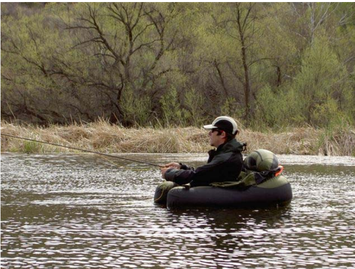
Enjoying Pena Blanca after a stocking in Winter