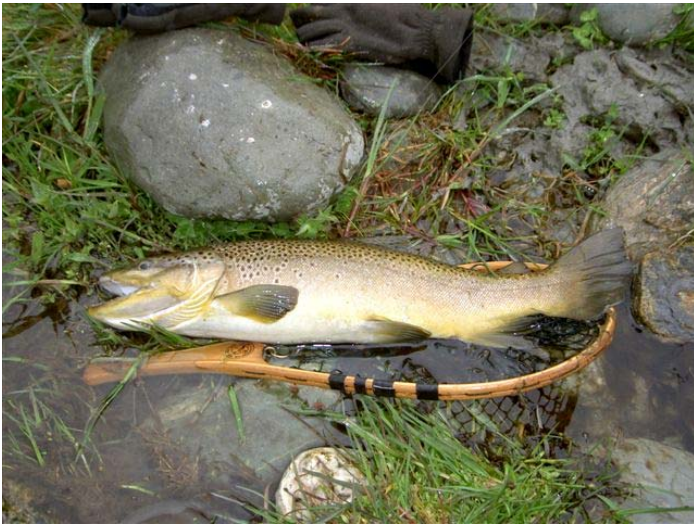
New Zealand Brown