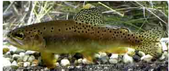
OPTU's Save the Natives – Apache Trout

Swap Meet – bring your stuff and swap or sell with others. Sheraton Tucson at 5151 E. Grant Rd (NE corner of Grant and Rosemont) – 7 pm, June 6 th .