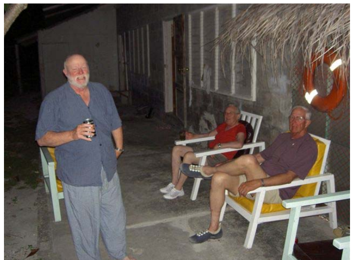
After a hard day of fishing

Lots for sale at the SWAP MEET. Come to the meeting in June and bring your stuff to sell or trade.