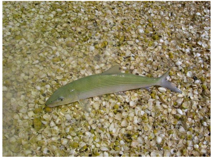
Love dem bones

Tightlines Flyfishing – In town casting clinics are currently available, $40/student, Saturdays and Sundays throughout the spring, call 322-9444 during business hours for reservations. A flyfishing school is scheduled for June 9 and 10 at the X-Diamond Ranch near Greer, cost is $200 for the weekend, lodging and transportation not included.