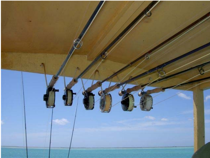
The Christmas Island arsenal