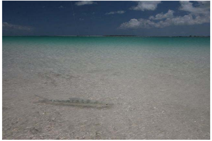
Spot the bonefish – easy eh?