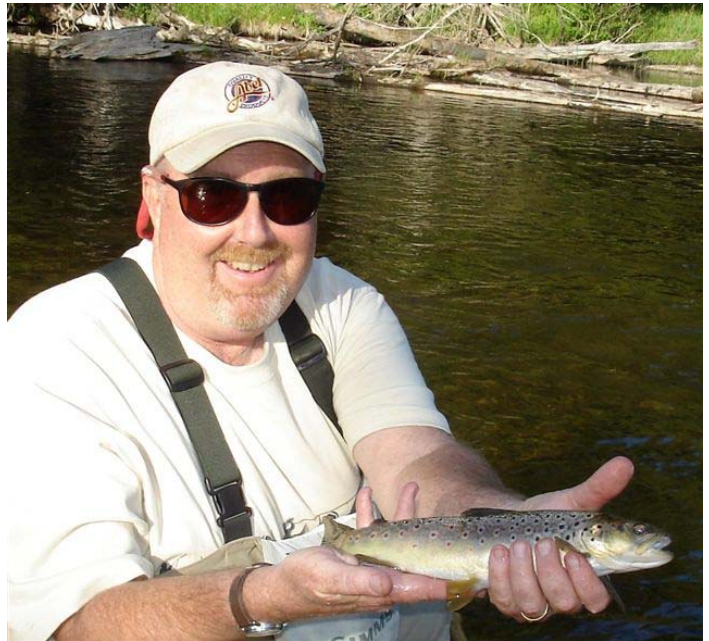
The pres with an AuSable brown