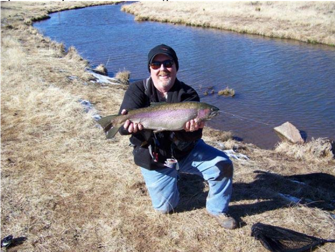
Collins and Silver Creek