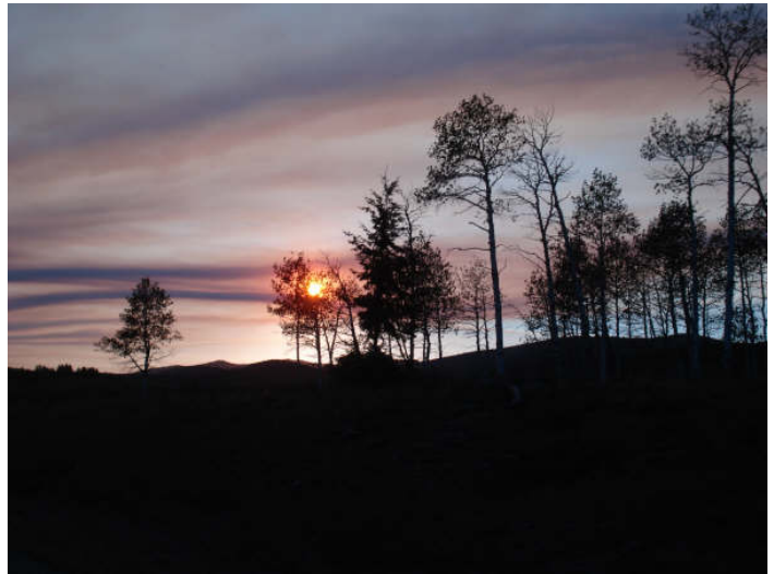
Sunset at the Green River

If you have access to a computer and e-mail help us reduce mailing costs by getting the Newsletter electronically. Just e-mail murphy@pharmacy.arizona.edu & cc: sreiter4@cox.net , Subject: e-mail newsletter . Give your name , the zip code where you normally receive the printed version and the e-mail address where you want to receive the electronic version. Note – it will be your responsibility to inform us of changes in e-mail address. Otherwise, you may begin missing newsletters. The newsletter is available on our OPTU website www.optu.org .