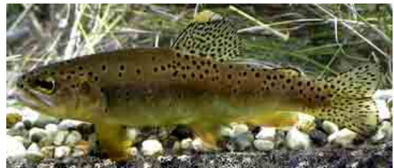
OPTU's Save the Natives – Apache Trout