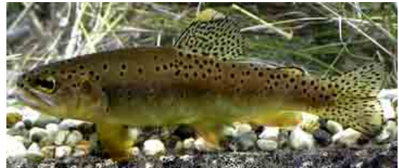
OPTU's Save the Natives – Apache Trout