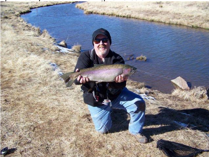
Collins and Silver Creek