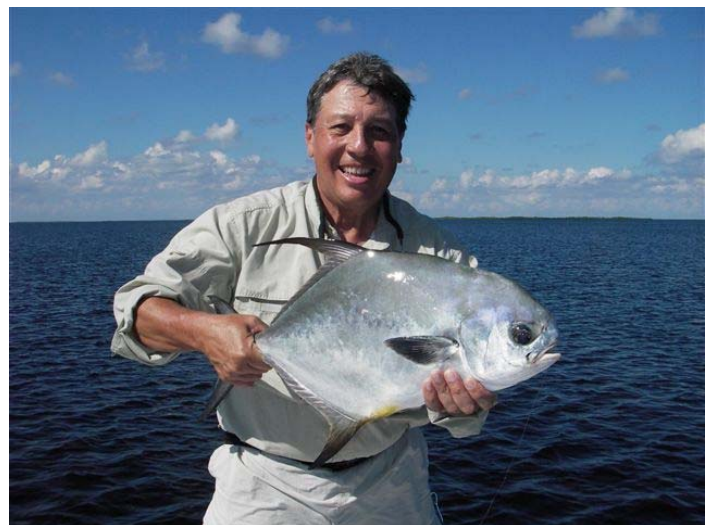
Gradillas and permit

A BARGAIN! - If you are over 70, and have lived in Arizona for 25 years you can get a Pioneer Fishing License - free for lifetime! Go to the Game & Fish office at 555 N Greasewood Road. Their phone is 628-5376. Clay Evitts