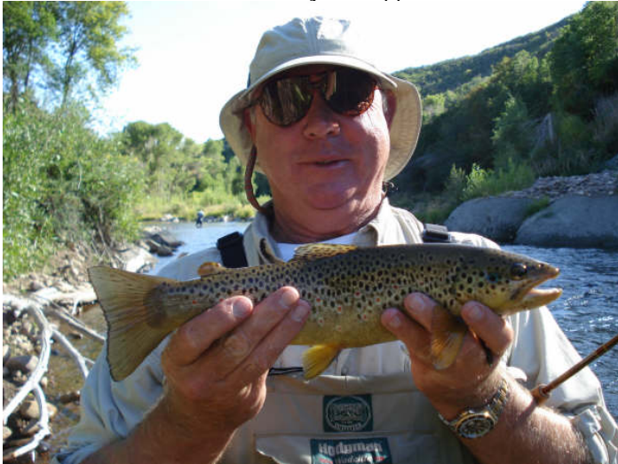
Nice Provo Brown

Renewal Rebates for New Members TU National gives rebates to chapters for new members. If you know of someone wanting to become a new member of TU, have them put chapter #531 on their application. This will help us receive the rebate. Thanks for your support.