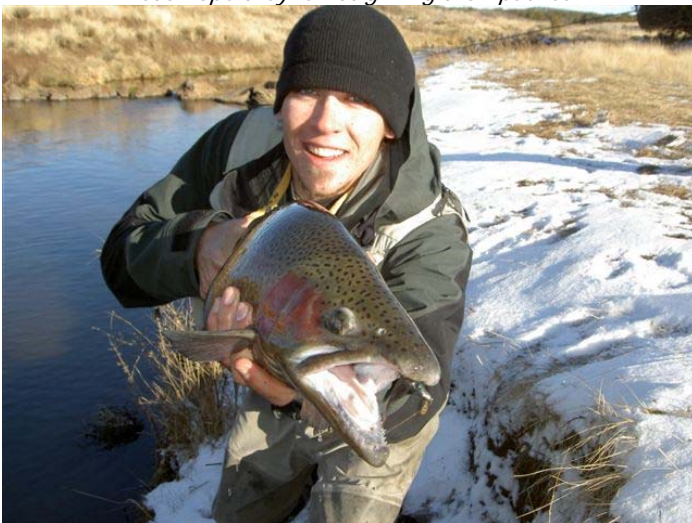
Big Silver Creek Bow