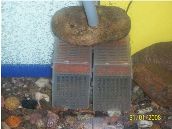
A Vibra Box