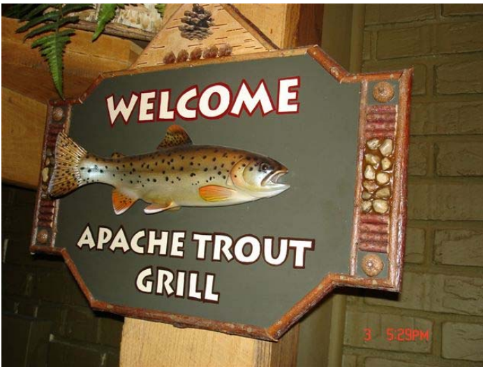
Let's hope they're not grilling the Apaches

If you have access to a computer and e-mail help us reduce mailing costs by getting the Newsletter electronically. Just e-mail murphy@pharmacy.arizona.edu & cc: sreiter4@cox.net , Subject: e-mail newsletter . Give your name , the zip code where you normally receive the printed version and the e-mail address where you want to receive the electronic version. Note – it will be your responsibility to inform us of changes in e-mail address. Otherwise, you may begin missing newsletters. The newsletter is available on our OPTU website www.optu.org .