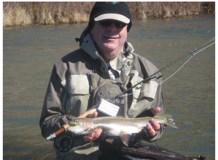
At the San Juan

The 7 th annual trip will likely occur about the same time next year. More on that later. The editor