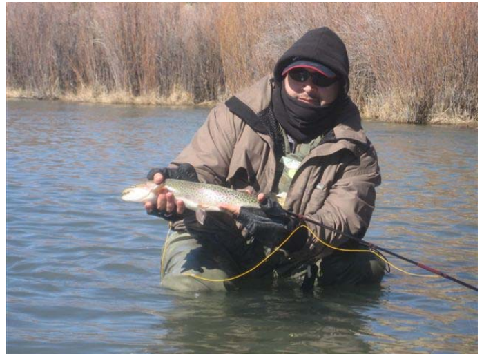
More from the San Juan