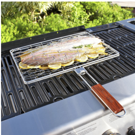
Grill basket example

Here is the Soy Vay website so you can see what the bottles look like. http://www.soyvay.com/