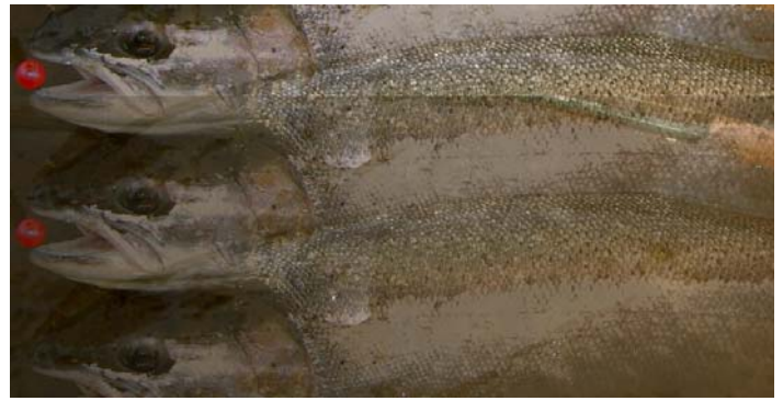
Dreaming of Triple Steelhead

Thank-you again, and best to you all. Rod McLeod