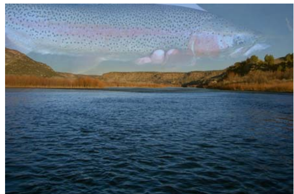
Rainbows over the Juan