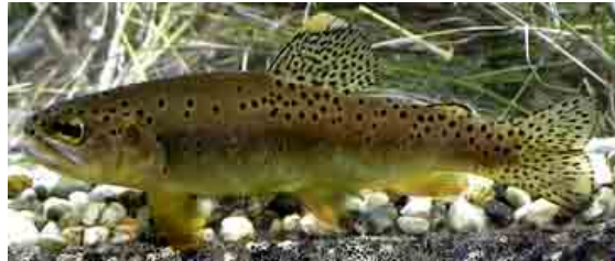
OPTU's Save the Natives – Apache Trout