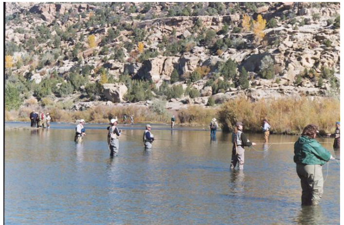
San Juan Madness