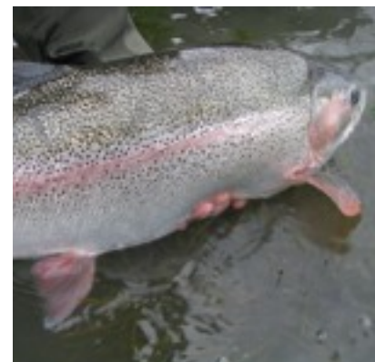
A few Alaska beauties