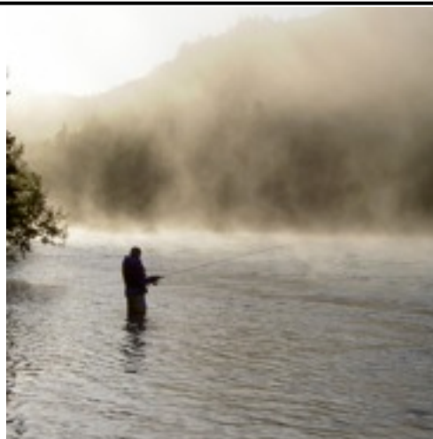
Theme photo for 2009 - Foggy morning at the J-hole, Kenai River, Alaska

Jim Lynch , Old Pueblo Chapter - Apache Trout (Arizona) (520) 742-7708